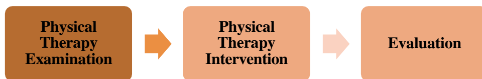
Figure 1. Data Collection Flowchart

The data collection procedure in this study was conducted systematically and sequentially through three stages. The data collection flow is presented in the following chart: